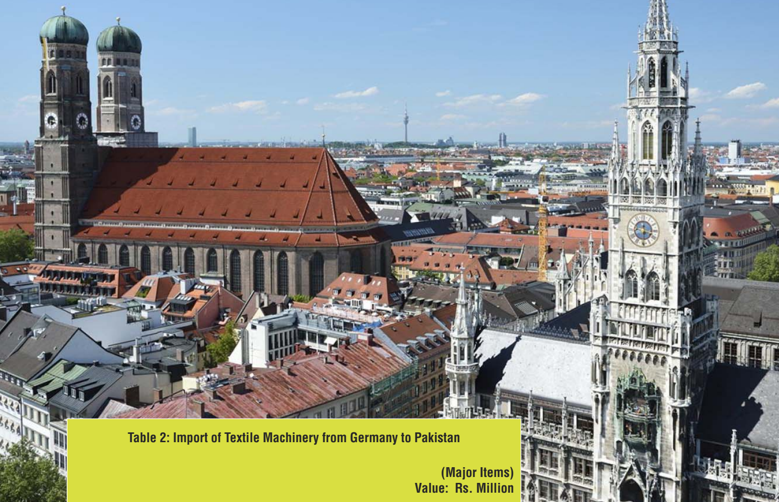
Table 2: Import of Textile Machinery from Germany to Pakistan