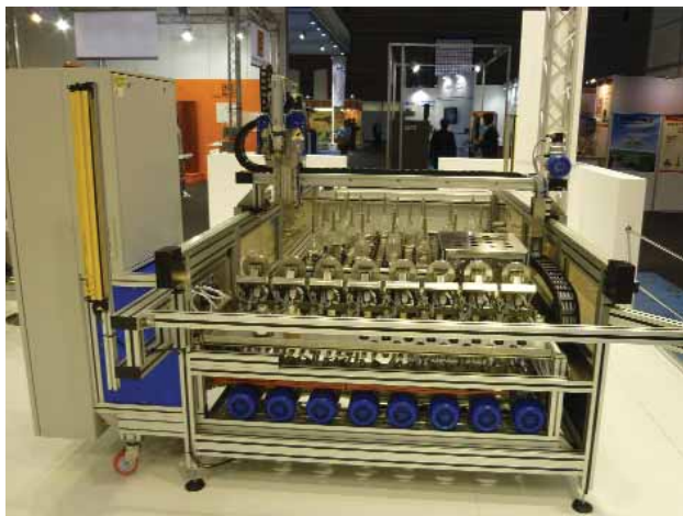
Dos & Dye machine.

Tecnorama explains, "The economic advantages of Dos & Dye machine are obvious: not only a considerable saving in human resources, but also the significant increase at a general qualitative level "right first time", due to the completely computerized control of the process, and at an operational level, with a drastic reduction in delivery times: "just in time".