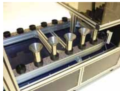
This picture shows the detail of Dosorama HS.

Patented all over the world, the machines conceived and proposed by Tecnorama confirm the engagement and the passion of the technicians of Research and Development Centre to answer to market needs, offering efficient solutions to obtain the exact planned result by optimizing resources and costs. ♦