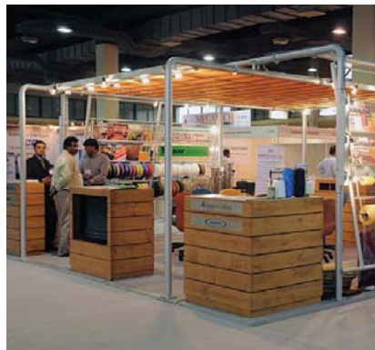
Syntech Fibers Pvt. Ltd. presented Duralene brand of polypropylene fibres and yarns.