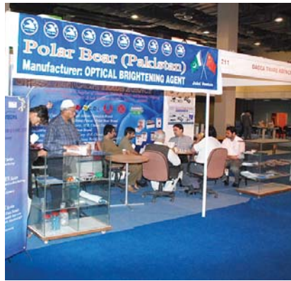
Polar Bear Pakistan are the manufacturers of optical brightening agent with Chinese joint-venture.