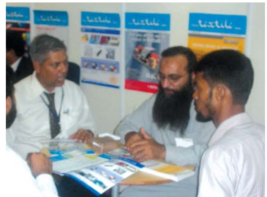
B2B meeting at Pakistan Textile Journal .

Sindh Industries Minister, Rauf Siddiqui speaking at 8 th International Machinery Exhibition of Garments and Textile Technology Pakistan pointed out that he had requested the President and the Prime Minister to allow a tax holiday of 10 years on setting up of agro based industries in smaller towns of the province, including Larkana.