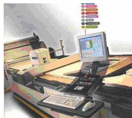
Vector – Automatic cutting system

Vector Cutting system can be horizontally moved on multiple spreading tables for continuous cutting, thus ensuring