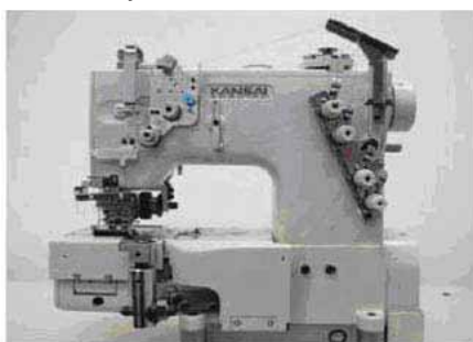
KANSAI - DLR-1509P

FBX-1104P/LS is 4-needle semi-cylinder bed lockstitch and double chain stitch machine for waist banding operation with needle feed mechanism and rear puller. This is one of the latest innovations of KANSAI. The machine comes with five user-friendly features.