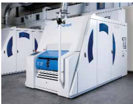
Truetzschler Card TC 7 with TCC card clothing accessories.

John D. Hollingsworth on Wheels, Inc. in Greenville, SC shut its doors on December 31, 2009. All the production facilities, patents, and copyrights were taken over on December 30, 2009 by the Trützschler Group, represented by American Truetzschler Inc. in Charlotte, NC and Trützschler Card Clothing TCC. This takeover allows Trützschler Card Clothing to continue seamlessly with the Hollingsworth production program, adding it to its existing production locations.