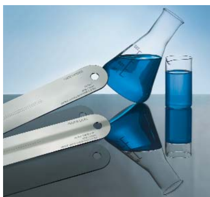
Felting HyTec process water analysis.