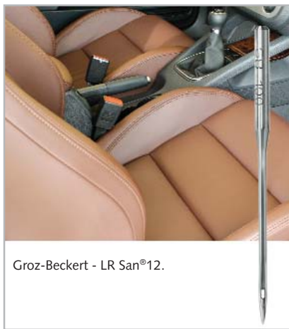
Groz-Beckert - LR San® 12.