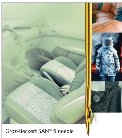
Groz-Beckert SAN® 5 needle