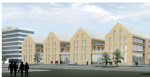
Technology and Development Centre at Albstadt, Germany.

For many years now, the Techtexsil offers exhibitors and visitors a dynamic international meeting place for the high tech industry. Groz-Beckert presented its product diversity for knitting, weaving, felting and sewing to the international experts. Technical textiles, in particular, are becoming increasingly important. In 1985 they accounted for a mere 5 to 8 percent share of global production; today that figure is 40 percent and Groz-Beckert is going to be making an intense commitment to this future sector.