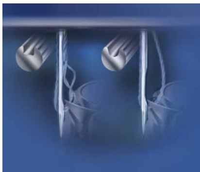
LPC - Loop Position Control.

The result: Improved protection of threads, and substantially better and more stable loop formation in critical applications. Skipped stitches and thread breakage due to poor loop formation are consequently reduced when working in difficult conditions.