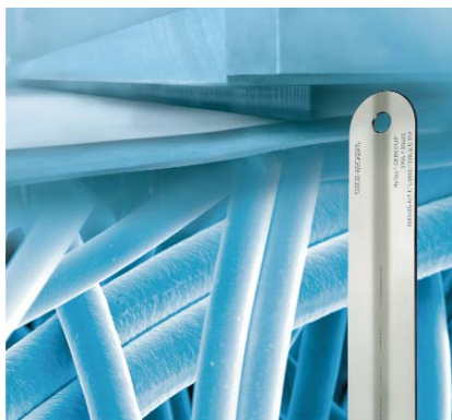
HyTec Jet Strip 2

This impacts negatively on the physical characteristics of the spun lace product. Consequently, jet strips require professional cleaning at regular intervals to remove deposits, while taking care to protect the sensitive structure of the jet strip. Aspects such as working safety and environmental protection also play an important role.