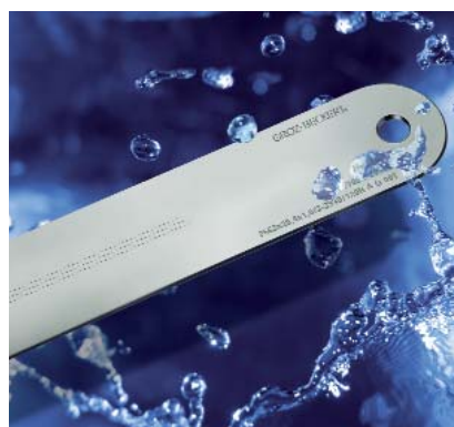
HyTec Jet Strip Cleaning instructions.