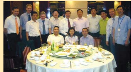
Shaoxing Hezhong Fibre Co. "Celebration of order for 4 th Spunlace Line."

The first order was awarded by Shanghai BG Industrial Fabric Co. , one of the leading producers of needle punched filtration felts in China. The AquaJet-spunlace machine will be designed for the production of heavy webs from polyester, P84, Nomex, PTFE, glass reinforced products and other materials. Due to weights of up to 600 gsm, pressures of up to 400 bars will have to be applied, a challenge that only Fleissner can handle due to past industrial references for a different