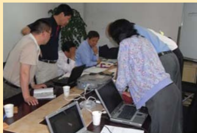
Technical design meeting at BG Filter, Shanghai.

The second order was placed by Shaoxing Hezhong Fibre Co. for their fourth spunlace line. The line will be designed for lightweight nonwovens up to 80 gsm at high production speeds. All hydroentanglement machines of the three existing lines had already been supplied by Fleissner and are operating at highest throughput and availability to the full satisfaction of Shaoxing Hezhong Fibre Co. ♦