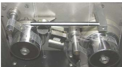
PROMPT ATQ - an online sensor system for monitoring of the yarn tension during the air texturizing process.

RETECH AG is a manufacturer of high efficient mechanical and electrical components for textile machinery. Apart from the tension sensors, RETECH AG also develops and produces heated godets with measuring- and control systems, customized draw units and yarn finishing of synthetic yarns.