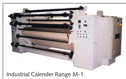
Industrial Calender Range M-1.

Alia International has recently announced their representation of Lemaire in Pakistan. One of the most well known type of machines produced by Lemaire is the ROLLINGSTATIC range of transfer printing calenders as well as the range of dry-laminating calenders.