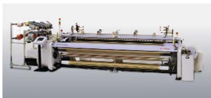
Vamatex Silver HS Rapier Weaving Machine.

An advanced development of the propeller rapier movement system and the optimized shedding geometry makes the Vamatex Silver HS the most competitive rapier weaving machine in the market. End users benefit from the highest speed, low maintenance requirements, fast style change and lowest production cost. This model is best suitable for home textiles, high quality shirting and denim.